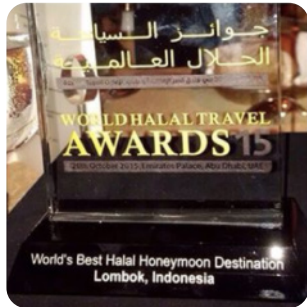
WORLD BEST HALAL HONEYMOON DESTINATION