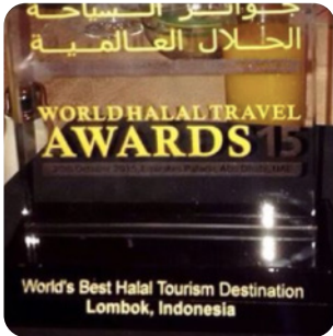
WORLD BEST HALAL TOURISM DESTINATION