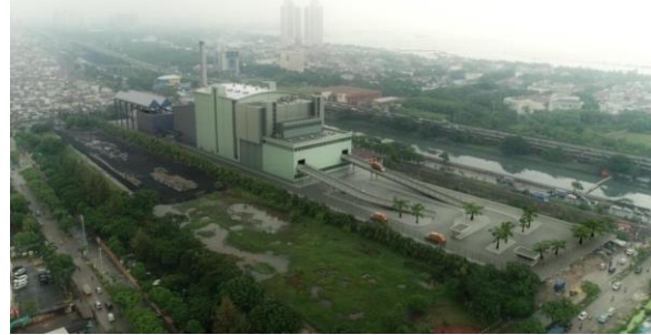
Jakarta Waste to Energy