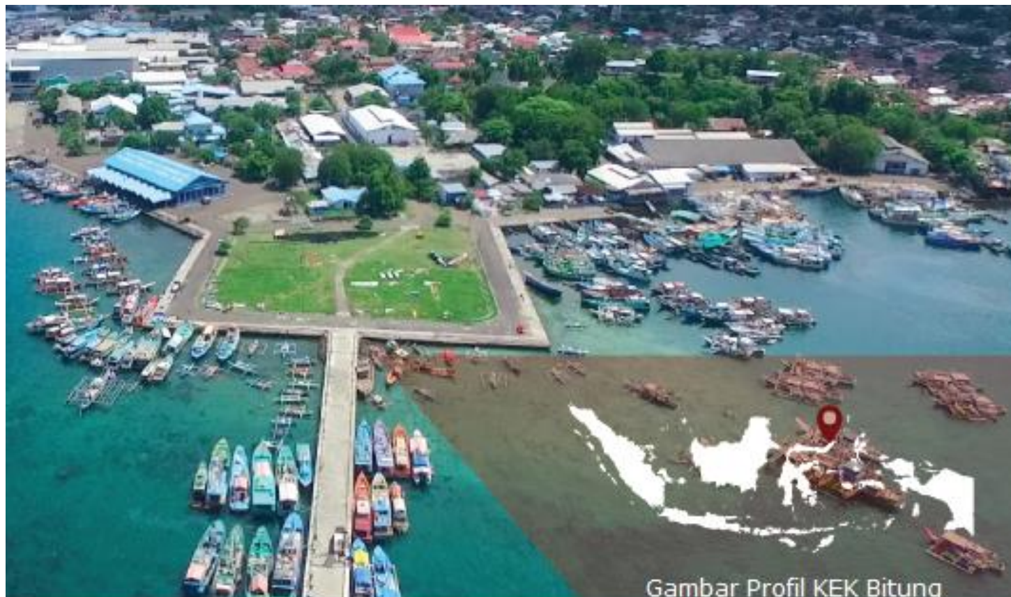
Gambar Profil KEK Bitung

The location of Bitung Special Economic Zone is strategic for fish processing industry where Sulawesi is one of the largest fish producers in Indonesia which is able to provide a significant contribution to Gross Domestic Product (GDP) and one of the largest fish exporter in Indonesia.